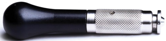
Tack Tool Applicator